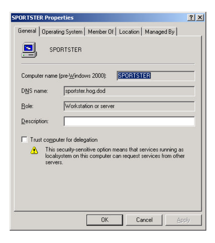
Figure 3 – Trust Computer for Delegation Option

By default, this option is unchecked. This is similar to the Account is trusted for delegation button, but many services run as the local administrator instead of as a user, so this is a way of controlling ticket forwarding on those services. This should be enabled only when needed.