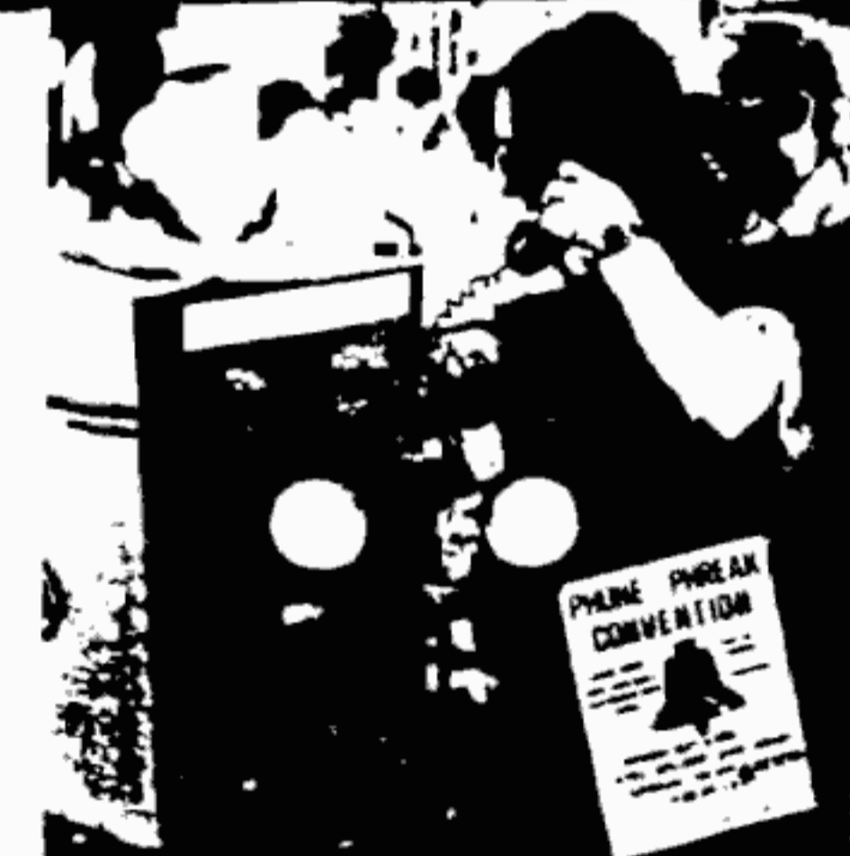
DISPLAYED RED BOX