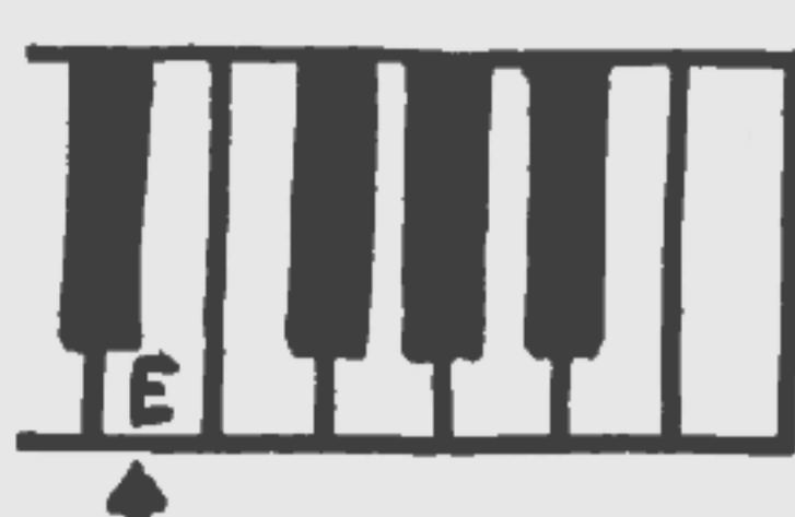
This is a picture of the top notes of a standard piano. The E note is 2637 cycles, slightly higher than the long-distance disconnect frequency.

YIPL has in the past been too difficult to understand, and we're trying to understand. Often we've been technically simpleminded, and we apologise to the numerous geniuses out there who patiently write in and tell us, but we're learning. Basically we're trying to digest the hard stuff, and print in simpler terms for use by beginners up. But there are lots of things all of us can do. For example, Ma Bell's new ways of catching blue boxers will be fouled up if we put in false indications of a BB. One way is to pick up your phone, and all your friends, dial long-distance info, and whistling 2800 cycles for a second and hanging up. This causes many wasted man-hours until they realize it was a false alarm. If we all do this from time to time, the BB detectors will be useless. And don't worry, it's legal to whistle. And fun, too! Our friends will dig doing it, and showing other people how also. 2800, by the way, is the highest "E" on a 88 key piano. Practice on an info operator, and when you hear a click after your whistle, you've hit it.