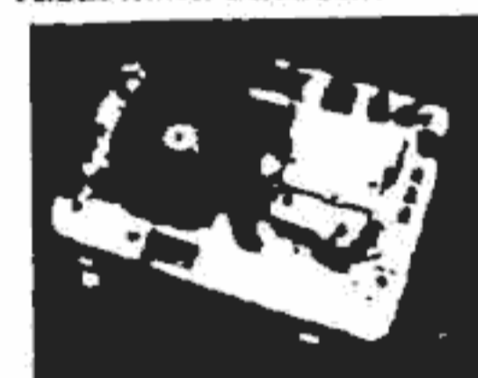
Model 250 Universal Telephone Decoder features automatic printout of both Touch-Tone and rotary dial signals. Instrument records date of call, off-hook time, on-hook time, and responds to asterisk and keyboard symbols whenever these special functions are utilized. Printed indication of the presence of 2028 Hz tones is available optionally.

Special Features: Model has polarity-independent input circuitry, negligible line loading and is internally protected against high voltage line transients.